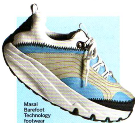
Masai Barefoot Technology footwear