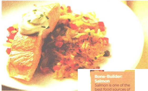
Bone-Builder: Salmon Salmon is one of the best food sources of vitamin D, which helps your body absorb calcium.

healthier bones. But a growing body of research supports the importance of other nutrients in helping the body absorb and process calcium, including vitamins D and K. We tapped Cat Cora, Iron Chef America star and cohost with chef Curtis Stone of Bravo's Around the World in 80 Plates , for two delicious ways to boost your intake of these key bone-boosters.