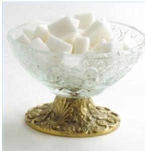
Eating too much sugar regularly can cause an addiction.

Like | Sign Up to see what your friends like.