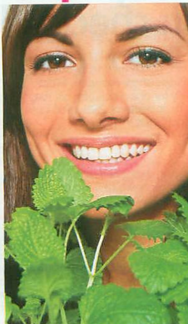
Peppermint's soothing properties can ease chronic tummy woes in as little as one week!