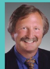
Jacob Teitelbaum, MD, is director of the Fatigue and Fibromyalgia Practitioners Network and author of the popular free iPhone & Android application "Cures A-Z," and of the best-selling book From Fatigued to Fantastic! ,

Finally, ribose (Corvalen by Douglas Labs) is the backbone of energy production in the body. We have done two studies of approximately 300 people with CFS/Fibromyalgia, which included 54 different health practitioners. People treated with ribose showed an average increase in energy of approximately 60 percent in only three weeks, also improving mental clarity, sleep, pain and overall well-being dramatically. Many had a "WOW!" effect. Dosing? Give 5 g (one scoop) three times a day for three weeks and then twice a day. Corvalen looks and tastes like sugar and can be mixed with any food or drink.